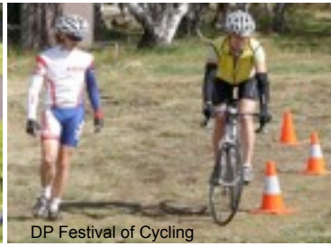
DP Festival of Cycling